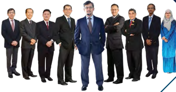
KPJ IPOH Board of Director 2019