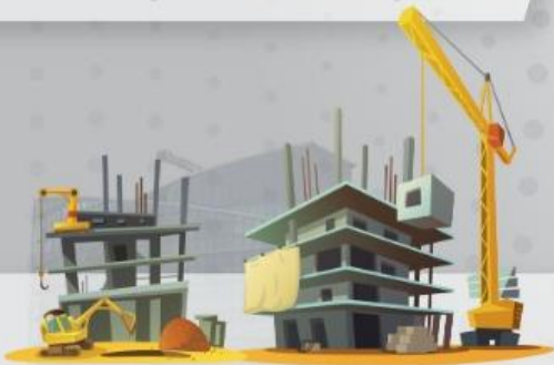
Construction projects and services related to construction works: