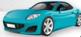
Automotive industry (limited to exports of CBU, parts and components, as well as after-sale services, e.g., repair and maintenance)