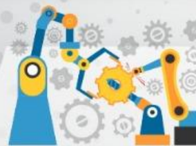
Machinery and equipment industry